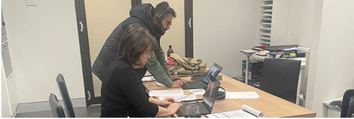
In photo: IPAA ACT capability team delivering our online Future Leaders Program